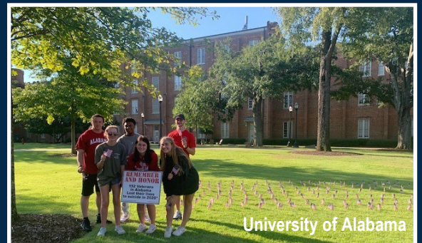
University of Alabama