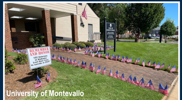
University of Montevallo