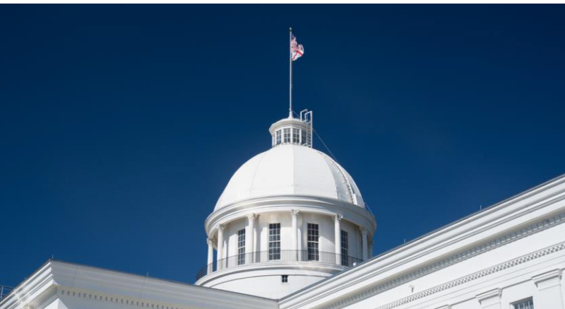
Commissioner, Alabama Department of Veterans Affairs