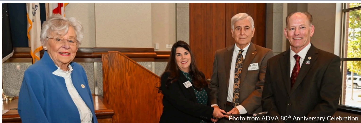
Photo from ADVA 80 th Anniversary Celebration